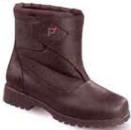
SleetWalker WB008 Black/Black N(AA) 7-11 / M(B) 5-11,12 / W(D) 6-11,12 / X(2E) 6-11,12 / XX(4E) 6-11,12