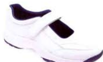
MaryLouWalker W3868 Black, White Navy M(B) 6-11 / W(D) 6-11 / X(2E) 6-11