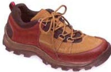
TurfWalker M4003 Grey Nubuck/Black, Olive Nubuck/Brown M(D) 7-12,13,14,15 / X(3E) 8-12,13,14,15 / XX(5E) 8-12,13,14,15