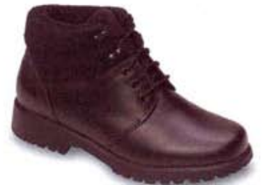
SnowWalker WB006 Black/Black M(B) 5-11,12 / W(D) 6-11,12 / X(2E) 6-11,12 / XX(4E) 6-11,12