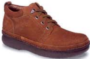
VillageWalker Mid M4078 Black Grain, Brown Grain, Choco Grain Nubuck M(D) 7-12,13,14,15,16,17 / X(3E) 8-12,13,14,15,16,17 / XX(5E) 8-12,13,14,15,16,17 ▲ Not available in Brown Grain ▲ Size 16, 17 not available in Black Grain