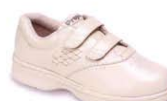
VistaWalker Strap W3915 Black Smooth, Bone Smooth, Taupe Smooth, White Smooth N(AA) 6-11,12 / M(B) 5-11,12 / W(D) 6-11,12 / X(2E) 6-11,12 / XX(4E) 6-11,12