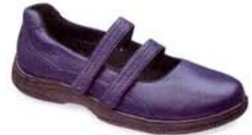
TwiliteWalker W1002 Black, Bone Smooth, Navy, Plum M(B) 6-11 / W(D) 6-11 / X(2E) 6-11