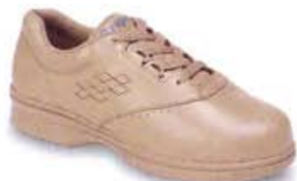
VistaWalker W3910 Black Smooth, Bone Smooth, Taupe Smooth, White Smooth N(AA) 6-10,10.5 / M(B) 5-11,12,13 / W(D) 6-11,12 / X(2E) 5-11,12,13 / XX(4E) 5-11,12 ▲ Sizes 5,5.5 not available in Bone Smooth; size 13 not available in Taupe Smooth