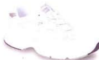
StabilityWalker W2034 Black, Sport White, White, Grey/Navy Nubuck, Mushroom/Choco Nubuck N(AA) 6-11,12,13 / M(B) 5-11,12,13 / W(D) 5-11,12,13 / X(2E) 5-11,12,13 / XX(4E) 5-11,12,13 ▲ Not available in Mushroom/Choco Nubuck W, X, XX sizes 5 and 5.5 available in White only; X, XX 5 and 5.5 in Black.