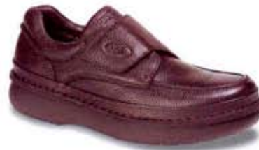
Scandia Strap M5015 Black Grain, Dark Brown Grain M(D) 7-12,13,14,15 / X(3E) 7-12,13,14,15 / XX(5E) 7-12,13,14,15