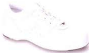
WashableWalker W3840 Blue, Pink, White, Royal Blue/White, Bone/White S(4A) 7-11 / N(AA) 6,6.5,7-11 / M(B) 5-11 / W(D) 5,5.5,6-11 / X(2E) 5,5.5,6-11 ▲ Narrow sizes 6,6.5 and W,X sizes 5, 5.5 available in white only.