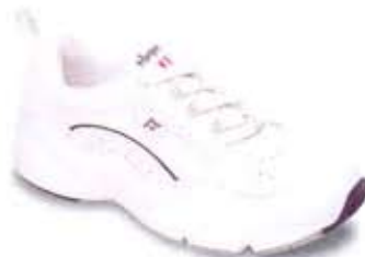
PedWalker 8 WPED8 White/Blue N(AA) 7-11,12,13 / M(B) 5-11,12,13 / W(D) 6-11,12,13 / X(2E) 6-11,12,13 / XX(4E) 6-11,12,13