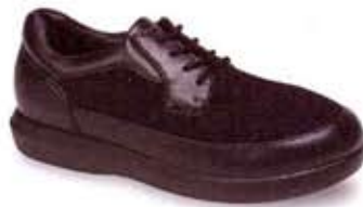
PedWalker 2 WPED2 Black Smooth Leather/Nylon M(B) 5-11,12,13 / W(D) 6-11,12,13 / X(2E) 6-11,12,13