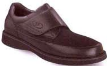
PedWalker 15 MPED15 Black Smooth Leather/Neo M(D) 7-12,13,14,15 / X(3E) 8-12,13,14,15 / XX(5E) 8-12,13,14,15