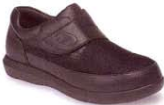
PedWalker 5 Strap WPED5 Black Smooth Leather/Nylon M(B) 5-11,12,13 / W(D) 6-11,12,13 / X(2E) 6-11,12,13