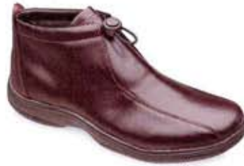
StarliteWalker W1000 Black Soft, Cordo Soft M(B) 6-11 / W(D) 6-11 / X(2E) 6-11