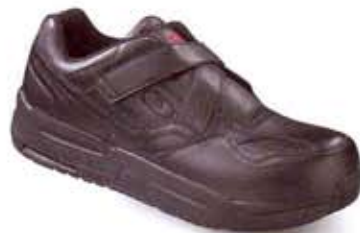
PedWalker 25 MPED25 Black Smooth, White Smooth N(B) 9-12,13 / M(D) 7-12,13,14,15 / X(3E) 8-12,13,14,15 / XX(5E) 8-12,13,14,15