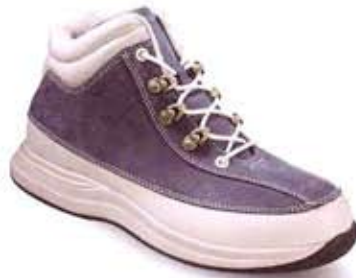
SohoWalker W4601 Black Grain, Plum Grain, Black Nubuck/Black, Coffee Nubuck/Bone, Denim Blue Nubuck/ Bone, Green Nubuck M(B) 5-11 / W(D) 7-11 / X(2E) 7-11