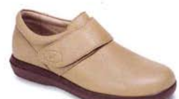
ValleyWalker Strap W4005 Black Grain, Taupe Grain N(AA) 6-11 / M(B) 5-11 / W(D) 6-11 / X(2E) 6-11 / XX(4E) 6-11