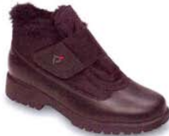
FrostWalker WB005 Black/Black, Brown/Taupe N(AA) 7-11,12 / M(B) 5-11,12 / W(D) 6-11,12 / X(2E) 6-11,12 / XX(4E) 6-11,12