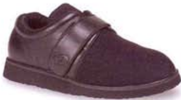
PedWalker 3 MPED3 Black Smooth M(D) 7-12,13,14,15 / X(3E) 8-12,13,14,15 / XX(5E) 8-12,13,14,15