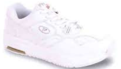
PedWalker 1 MPED1 Black Smooth, Nut, White Smooth N(B) 9-12,13 / M(D) 8-12,13,14,15,16 / X(3E) 8-12,13,14,15,16 / XX(5E) 8-12,13,14,15,16 ▲ Available in White Smooth only