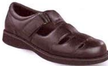
PedWalker 9 MPED9 Black Smooth M(D) 7-12,13,14,15 / X(3E) 8-12,13,14,15 / XX(5E) 8-12,13,14,15