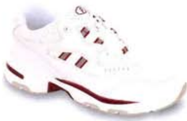
FlexWalker W5002 White/Brandy, White/Silver Smooth, Mushroom/ Choco Nubuck N(AA) 7-11,12 / M(B) 5-11,12 / W(D) 6-11,12 / X(2E) 6-11,12 / XX(4E) 6-11,12