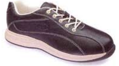
JazzWalker W4607 Black/Bone, Navy/Bone, Plum/Bone M(B) 5-11 / W(D) 6-11 / X(2E) 6-11