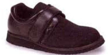
PedWalker 3 WPED3 Black Smooth Leather/Nylon M(B) 5-11,12,13 / W(D) 6-11,12,13 / X(2E) 6-11,12,13