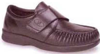
PuckerMoc Strap M3925 Black M(D) 7-12,13,14,15,16 / X(3E) 8-12,13,14,15,16 / XX(5E) 8-12,13,14,15