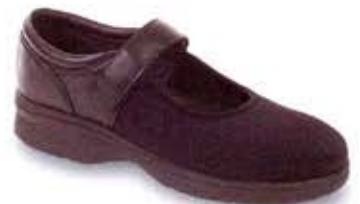
PedWalker 11 WPED11 Black Smooth Leather/Nylon M(B) 5-11,12,13 / W(D) 6-11,12,13 / X(2E) 6-11,12,13