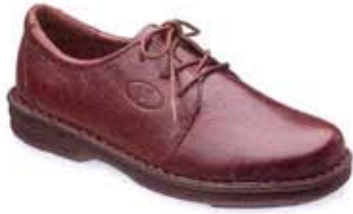
SuburbanWalker W4513 Black, Plum M(B) 5-10,11 / W(D) 6-10,11 / X(2E) 6-10,11 / XX(4E) 6-10,11