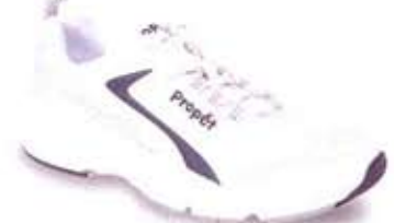
SprintWalker W2038 White/Slate Blue N(AA) 7-11 / M(B) 5-11 / W(D) 6-11 / X(2E) 6-11 / XX(4E) 6-11