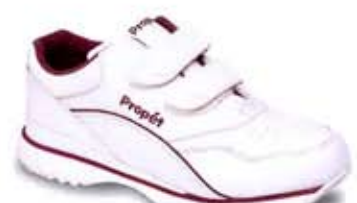
TourWalker Velcro® W3902 Black, Sport White, White, White/Berry, White/Blue N(AA) 6-11,12 / M(B) 5,5.5,6-11,12 / W(D) 5,5.5,6-11,12 / X(2E) 5,5.5,6-11,12 / XX(4E) 5,5.5,6-11,12 ▲ W, X, XX sizes available in White/Berry and White/Blue only ▲ Available in Sport White and White only