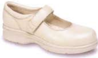
MaryJane Walker W0029 Black Smooth, Bone Smooth, White Smooth, Choco Nubuck, Navy Nubuck M(B) 5-11 / W(D) 6-11 / X(2E) 6-11 / XX(4E) 6-11 ▲ Available in Black Smooth and White Smooth only.