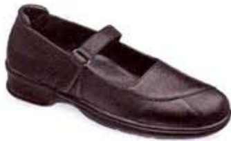
Mary JoWalker W2019 Black Smooth, Bone Smooth, Plum Soft Grain N(AA) 7-11 / M(B) 5-11 / W(D) 6-11 / X(2E) 6-11