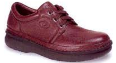
VillageWalker M4070 Black Grain, Brown Grain, Choco Grain Nubuck N(B) 9-12,13,14 / M(D) 7-12,13,14,15,16,17 / X(3E) 7-12,13,14,15,16,17 / XX(5E) 7-12,13,14,15,16,17