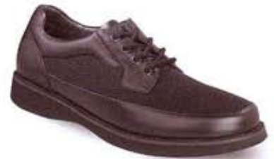
PedWalker 10 MPED10 Black Smooth Leather/Neo M(D) 7-12,13,14,15 / X(3E) 8-12,13,14,15 / XX(5E) 8-12,13,14,15